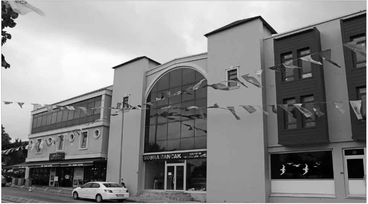
The Bosna Sancak Kültür ve Yardımlaşma Derneği in Bayrampaşa, with the plainly visible Old Bridge symbol in the building's façade.

Bayrampaşa obtained its current name quite recently, in 1978, and was previously called Sağmalcılar . Situated just extra muros the historical districts, and, from the present-day viewpoint, in the central realms of the rapidly growing megalopolis, Bayrampaşa's history is a history of migration to İstanbul — notably from the Balkans. According to the governorate ( Valilik ) of İstanbul, the first immigrants from the Balkans came from Plovdiv (Bulgaria) in 1927, and used the land for agriculture. In the 1950s, new settlers came from Macedonia, followed by a new wave of immigrants in the 1960s from Yugoslavia's Sandžak region. The role of those immigrants in shaping the character of today's Bayrampaşa is praised on the governorate's official homepage: