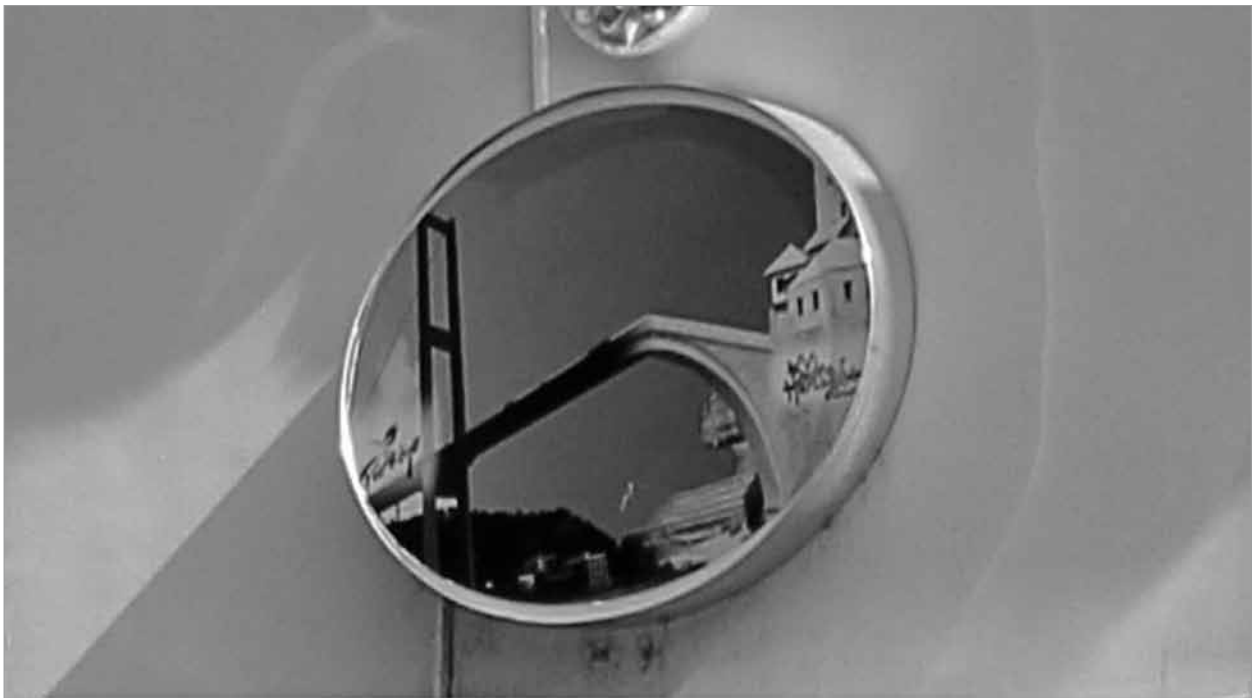
A combination of the Old Bridge in Mostar and the Fatih Sultan Mehmet Bridge in İstanbul. Advertisement of the travel agency Fidan Tours in Sarajevo.

Many Turkish shops, travel agencies, and others operate in Sarajevo and other Bosnian-Herzegovinian towns. We shall not forget the contribution of Turkey, who has co-financed the renovation of the Old Bridge in Mostar, of the Curved Bridge ( Kriva Čuprija ) in Konjic, the dervish lodge on river Buna, and other significant cultural-historical, religious and educational objects. Perhaps Turkey sees BiH as a big boost in her try to refresh its influence in this region, or, respectively, in the development of economic, cultural and sports cooperation with countries which were part of the mighty Ottoman Empire, but without real pretensions to revitalize that Empire, that former power on three continents”. 30