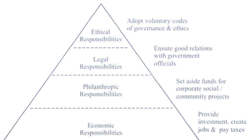
Figure 1. 1. Responsibilities Triangle

Actually, the responsibility of a company is to make profit to company owner in return for investment. The first and primary social responsibility is economic responsibilities.