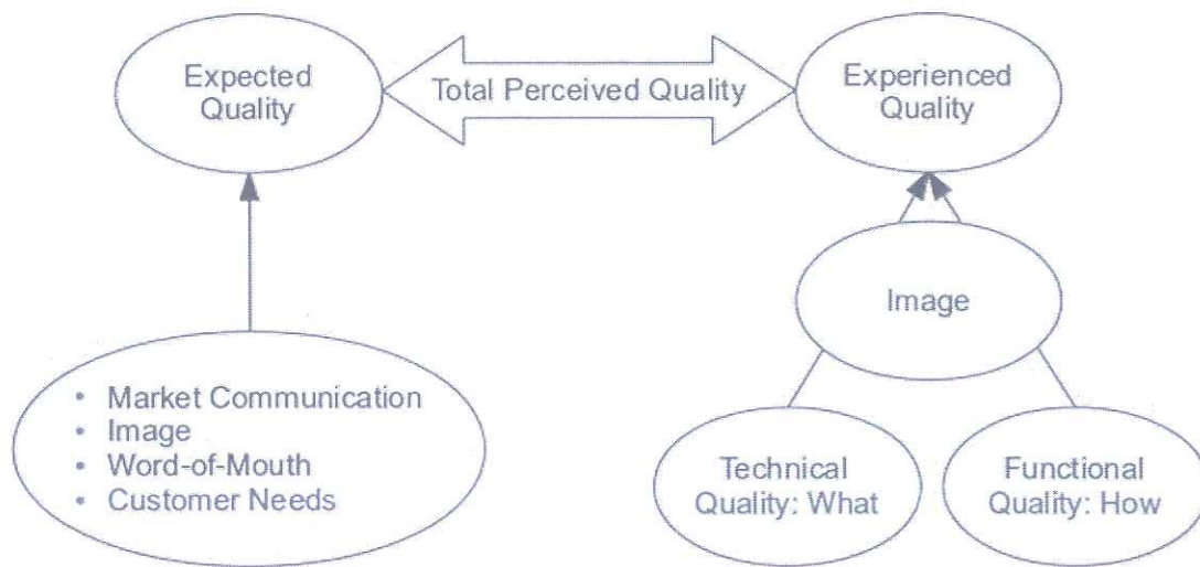
Figure 2. 1. The Quality Model of Grönroos and Gummesson

Design, production, delivery and relations are factors affecting service quality directly. However, these variables especially affect functional quality when the role of the customer gains importance in production system (Uyguç, 1998: 33).