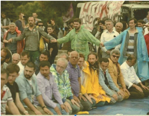
Figure 5. Praying.