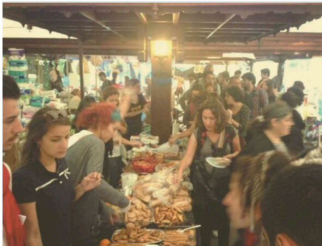
Figure 4. Eating.