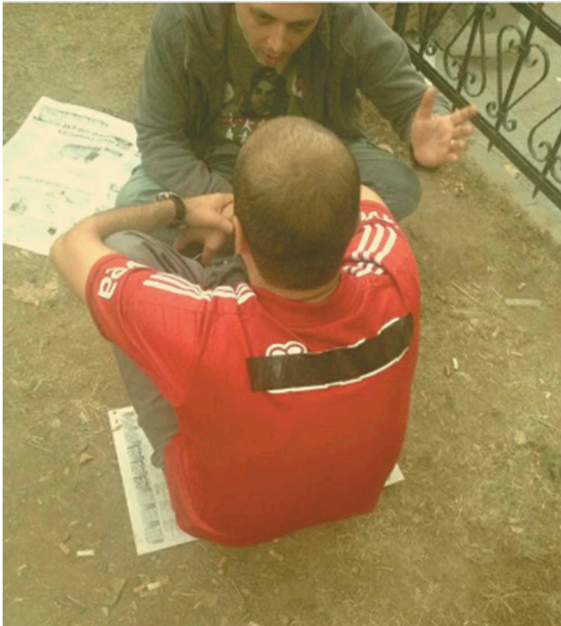
Figure 6. Talking.

In the depiction of everyday life there is an opportunity to communicate a vision of (or even a concept of) a different society in an embodied and practical way that is perhaps transient but nonetheless not completely intangibly 'utopian'. Thus, the visualization of the everyday serves a performative function as a form of lived 'world-making' and the seemingly inconsequential images of everyday life in the park bring attention to the ordinary as a crucial site of cultural politics. There is a clear strategic intervention with protestors