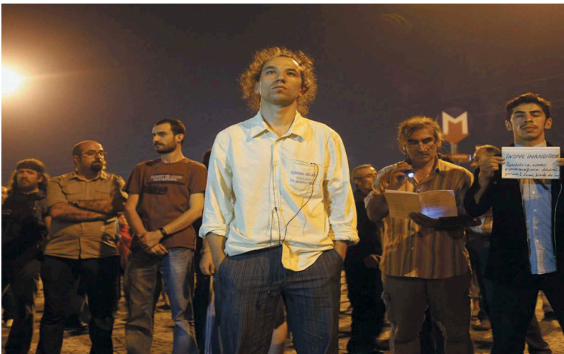
Figure 1. The standing man.

The importance of performance for activists has been noted, especially those that became iconic such as ‘The Standing Man’ protest when Erdem Gündüz, an artist, stood passively in Taksim Square facing the Ataturk Cultural Centre (see Figure 1). Gündüz’s ‘gesture’, a form of ‘radical passivity’, helped to challenge the narrative elaborated by the government that protestors were violent opportunistic looters (Nosthoff, 2016). This image of peaceful resistance was shared on social media using #duranadam (#standingman) and similar performances referencing Gündüz’s were occurring across Turkey and the world, becoming emblematic of the Gezi Park resistance. The emphasis on community and establishing interpersonal ties was key (Tugal, 2013) to the success of the standing man protest, as no demands were ever uttered. Its success, lies not in the outcomes but the performance itself: while protest is, of course, about change in policy and law, ‘it is also about intensifying political agency, and consciousness, to reclaim and redefine a people’ (Nosthoff, 2016, p. 331).