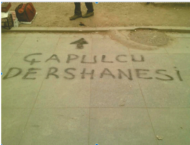
Figure 2. ‘Looter classroom’.

In the image below (see Figure 2 ) we see writing sprayed on to the pavement that reads ‘Çapulcu dershanesi’ which means ‘looter classroom’ – a satirical reference to the perceived bad influence of the activists, but also a symbolic gesture to the ‘re-schooling’ which protestors are undertaking themselves in exploring new ways of living and being, and new ways of expressing oneself in the public space, enacting more emphatic practices of citizenship. But the neologism ‘çapuling’ has also come to stand for what we may want to call awareness raising or one’s political awakening on issues such as the environment, rights of women, and democratic rights, which is also indirectly implied in the graffiti on the pavement. Activists’ identification with the term was further manifested when individuals added ‘çapulcu’ as a prefix to their Twitter name.