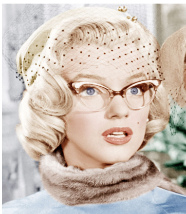
Figure 2.15: Marilyn Monroe in How to Marry a Millionaire (1953)