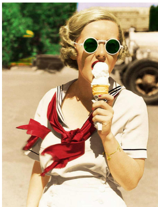
Figure 2.10 : Tortoiseshell Framed Glasses

The fashion pioneers of the 1930s were the stars of Hollywood from whom the women were impressed. Tortoiseshell framed tinted sunglasses used by these actresses become popular among women as a sportswear or beach accessory. (D'Souza, 2018) (Glamourdaze, 2013)