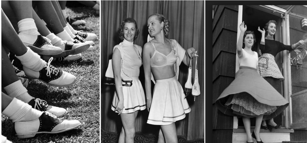
Figure 2.14: Saddle Shoes (Left), Chansonette Bra (Middle), Poodle Skirts (Right)

These dancers preferred moveable clothes and the poodle skirt allowed them to dance freely without any restrictions. Knee-length skirts were often worn with cardigans, frilly socks, and oxfords. In the '50s, with the start of dances such as Lindy Hop and Jitterbug, the saddle shoes became a most preferred shoe. These shoes, which look like Oxfords, can be worn in both sexes and in various colors. After a long period of scarcity, women discovered her chansonette bra, which emphasized the female silhouette. (D'Souza, 2018) (Parkin, 2017) The female