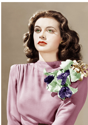
Figure 2.4 : 1940s, 50s and 60s have own vintage symbols.

Vintage is the old fashion items that are iconized by the time. Lots of designers inspire from the old styles while doing the new designs. The fashion blogs are designated the street style by inspiring from vintage trend.