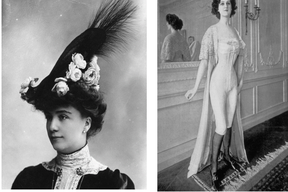
Figure 2.5 : Feathered Hat (Left) & Edward's Corset (Right)

In 1910s the feathered hats with wings that are often referred to, as the “Plume Boom” was popular. (D'Souza, 2018) (George-Parkin, fashion by the decade, 2017) (Spivack, 2013) Furthermore, Edwards corset, which puts the women body into a demand curve figure by pulling back the shoulders, raising chest, while shoving the hips backwards, highlights a woman's breasts and buttocks. (D'Souza, 2018) But nowadays they are retrieved and copied as symbolic vintage costumes for the specific occasions rather than daily usage by combining to create new recent style.