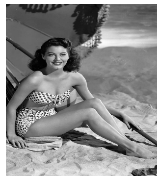
Figure 2.13: Two Pieces Swimsuit

Rosie Riveter, a character created by the government to involve women in the labor force, was one of the most iconic symbols of the decade. Women rolled their arms of clothes, tied their hair and began to work. Despite the lack of materials, creative solutions for garments came into life. Women recycled old clothes, linens, and other scrap materials to create new clothes.