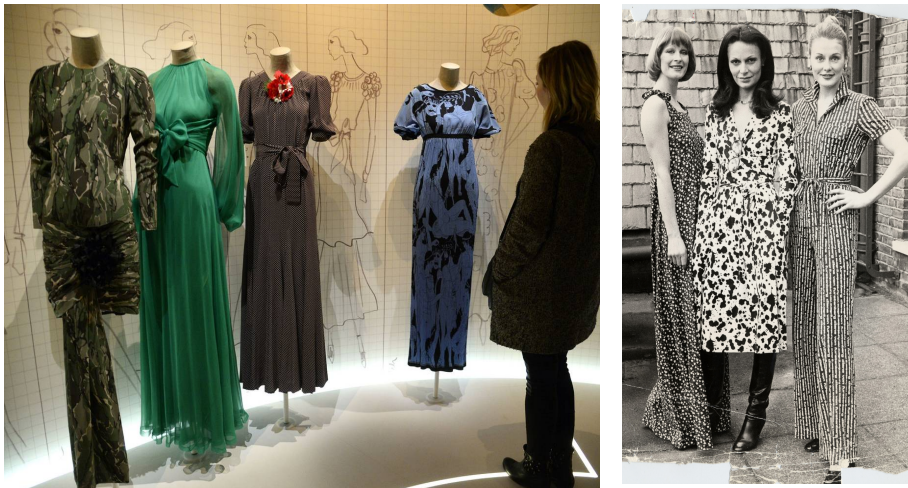
Figure 2:2 YSL Vintage Collection (Left) & Envelope Dress (Right)

Yves Saint Laurent Haute Couture 1971 that is one of the most famous collections of all time is recreated again. This is also another example of the literal revivals.