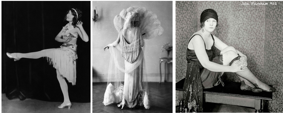
Figure 2.8: Evening Dresses in the 1920s

The silk stockings worn with shoes of the period were marked by the 1920s. In addition, velvet and furs are visibly used in outerwear. (Glamourdaze, 2013) In contrast to daily look, the evening dresses called flapper dresses were much more creative and inventive. Sequined fringe dresses, which were more probably preferred as a costume by dancers, were fashionable in 1920s. (D'Souza, 2018) (George-Parkin, fashion by the decade, 2017) (Glamourdaze, 2013)