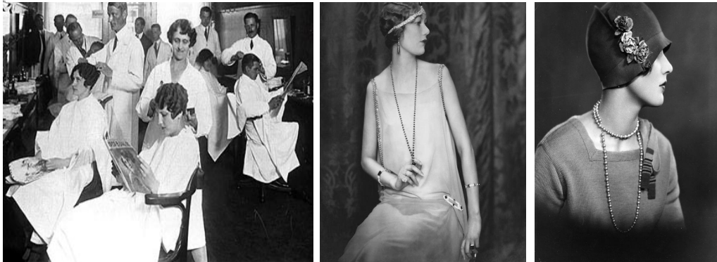
Figure 2.6: Bodded Hair Styles (Right), Headband & Cloche Hat (Left)

During these years, the Jazz Age influenced women to remove their corsets and uncomfortable underwear from their wardrobes and start dressing in the up-and-coming garconne look. Garconne means "boy" with a feminine suffix in French. This look was designed by Coco Chanel.