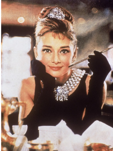
Figure 2.16: Audrey Hepburn in Breakfast in Tiffany's