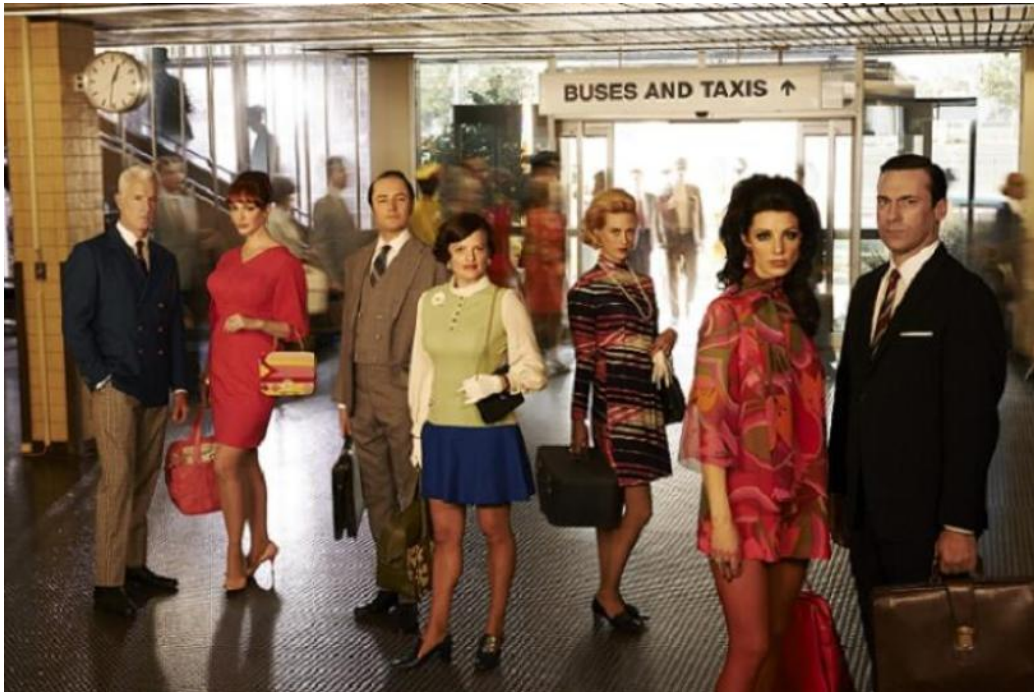
Figure 2:1: Madman the TV Series , (Source: Hoevel, 2014)

In the following sections, the diverse terminology attached to vintage will be detailed. The vintage term that is related to the old products are also categorized as ‘antique’, ‘retro’ even ‘secondhand’, it causes to misunderstanding and confusion around this context. The differences, similarities, and intersections of these terms are explained with the remarks of the previous literature.