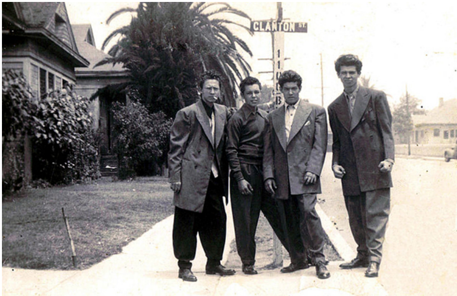
Figure 2.3: Zoot Suits

Vintage is the old fashion items that are iconized by the time. Lots of designers inspire from the old styles while doing the new designs. The fashion blogs are designated the street style by inspiring from vintage trend.