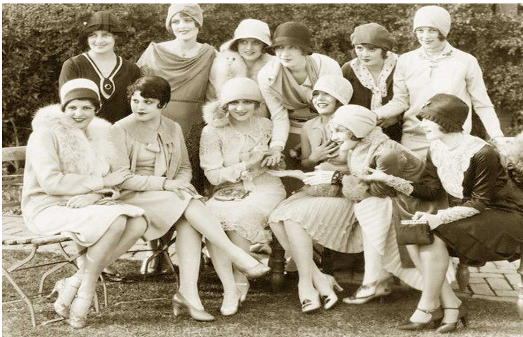
Figure 2.7: Garconne look was designed by Coco Chanel

During these years, the Jazz Age influenced women to remove their corsets and uncomfortable underwear from their wardrobes and start dressing in the up-and-coming garconne look. Garconne means "boy" with a feminine suffix in French. This look was designed by Coco Chanel.