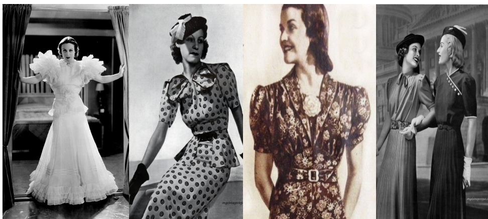
Figure 2.9 Women Silhouette in the 1930s

The silk stockings worn with shoes of the period were marked by the 1920s. In addition, velvet and furs are visibly used in outerwear. (Glamourdaze, 2013) In contrast to daily look, the evening dresses called flapper dresses were much more creative and inventive. Sequined fringe dresses, which were more probably preferred as a costume by dancers, were fashionable in 1920s. (D'Souza, 2018) (George-Parkin, fashion by the decade, 2017) (Glamourdaze, 2013)