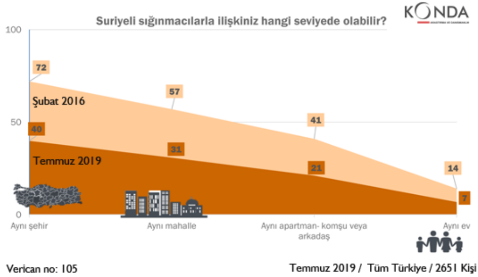
Figure 3.3 Graph of Percentage Change on the Perception of Syrian Asylum-Seekers (Statistics on the percentage of changes to the question of “What do you think is your relationship with Syrian Asylum-Seekers”).

Moreover, based on their fieldwork in İstanbul and İzmir, Altıok and Tosun observe that lack of interaction between two communities that are mostly caused by linguistic barriers and ghettoization of Syrians reinforces and reproduces the popular resentment (2018, p.3). In addition to these, Altıok and Tosun observe that public anger is not directed at Syrians just because they are Syrians, but because people feel threatened by different “outlooks and cultural practices” i.e. “manifestations of distinguishing cultural practices such as speaking Arabic, young Syrian males gathering in the neighborhoods, smoking shisha until late hours in the parks” (Altıok & Tosun, 2018, p. 4). Banning Syrians from entering the beach in Mudanya that I mentioned in the introduction could be another example because the Mayor of Mudanya defended himself by saying that they banned Syrians from entering the beach not because they are Syrians, but because they threatened the lifestyles of people in Mudanya by coming with camels and setting up tents to the